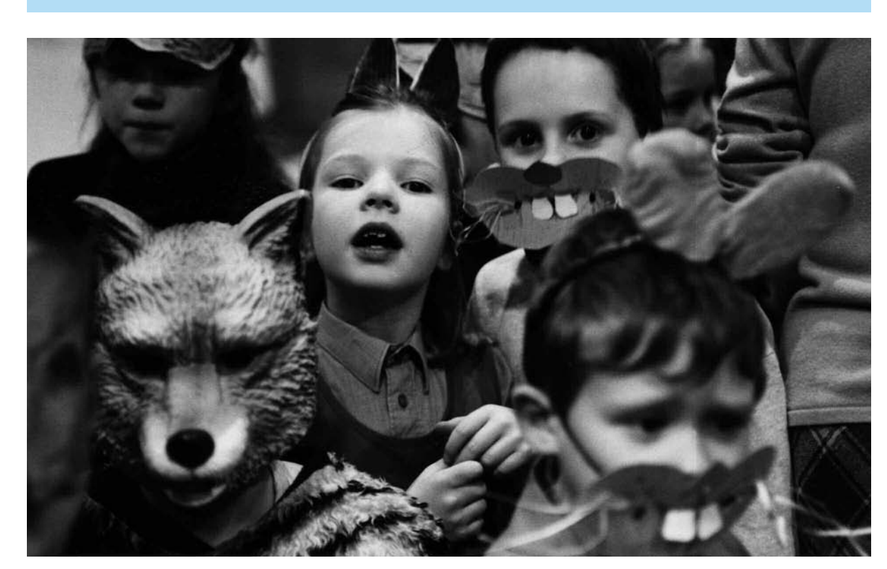
Children from S.N. Molaise, Grange preparing for a performance during a Vogler Quartet, Music Education Workshop, 2002.