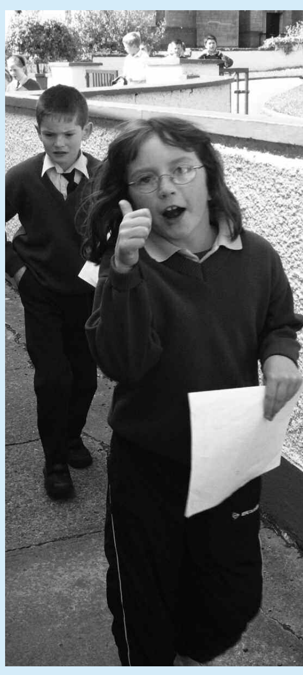
Thumbs up from one of the childern arriving for a Vogler Quartet, Music Education Workshop, Riverstown, 2003.