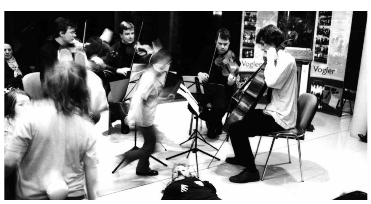
Children Performing at the launch of the Vogler Spring Festival, Sligo County Hall, 2001.

The Guth programme - On the other hand, the traditional music programme designed and delivered by traditional singer and musician Colm O'Donnell<sup>33</sup> played to the musical strengths of some teachers, and gave them another perspective on what can be achieved with a structured programme in a different genre.