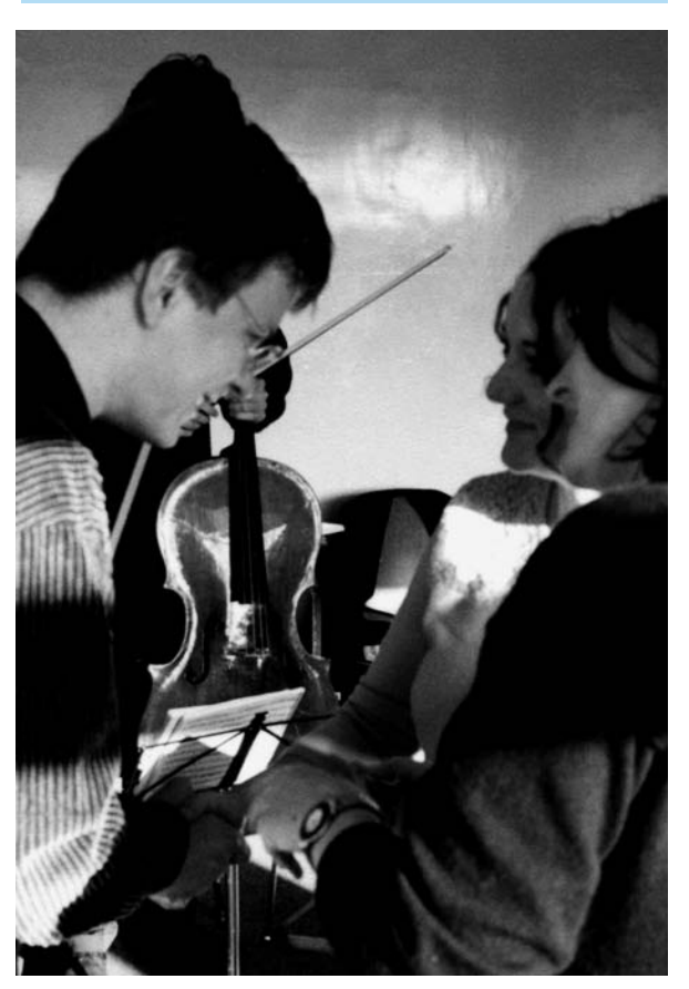
Vogler Quartet, Post Primary Music Education Workshop, Convent of Jesus and Mary, Enniscrone, Co. Sligo, 2000.

For future reference, teachers proposed more frequent opportunities for direct contact between the children and the musicians, in order to build relationships further and enhance opportunities for creative interaction.