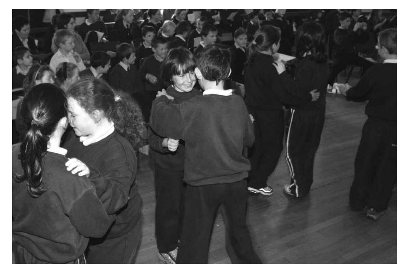
Childern dancing at a Vogler Quartet, Music Education Workshop, Riverstown Hall, 2003.

programme was the introduction of a less familiar musical genre that would not have been selected by the majority of teachers if they had been given the choice. Some independence is required if the facilitator is to retain the freedom to inject elements of musical and educational challenge to live music programmes in schools, and this should be borne in mind when collaborative planning processes are being developed.