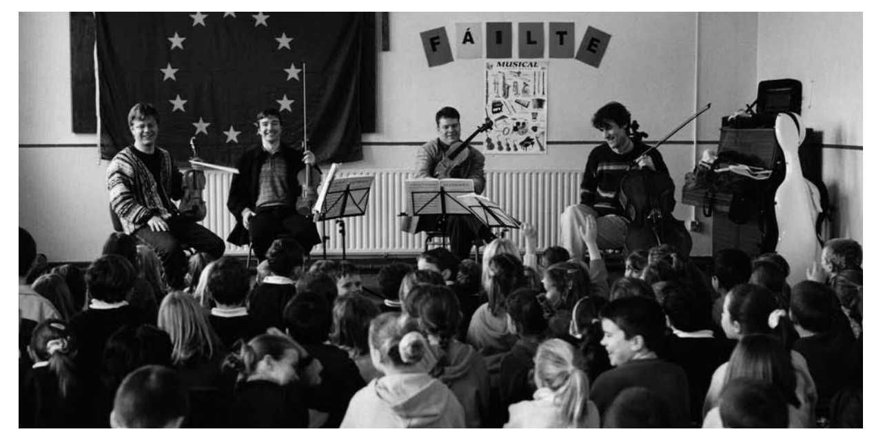
Vogler Quartet, Music Education Workshop, S.N. Realt Na Mara, Rosses Point, 2000.

Children who did attend the academy during the residency found their classroom encounters with the quartet significantly enhanced. Besides the opportunity to get to know the musicians better, they were invited to illustrate various musical points in the classroom and took an active part in collaborative performances with the quartet.